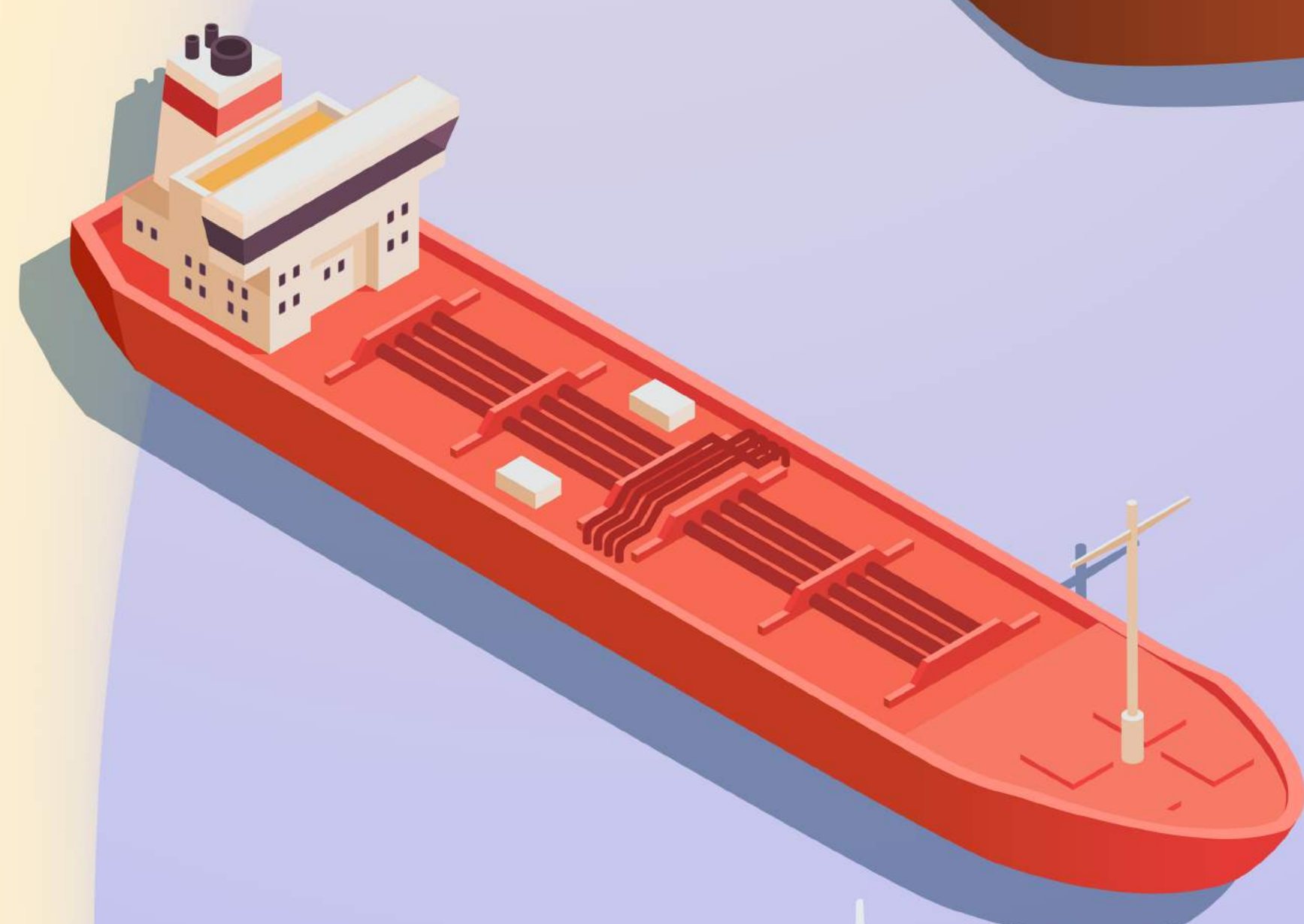
-CRUDE OIL TANKERS